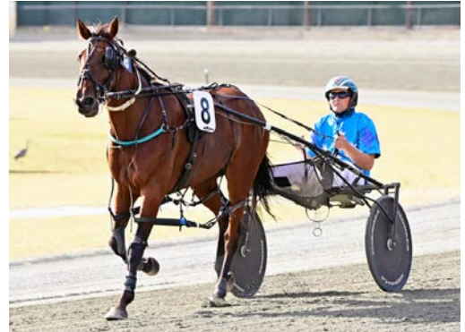
Purest Silk NZ